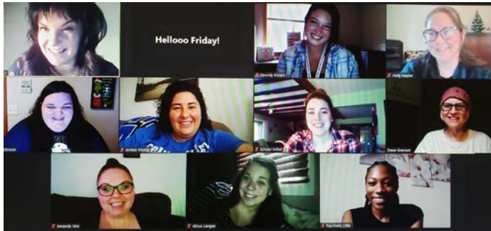
10 Brave Souls Attend the First Virtual Core Training!

In a year of chaos, unknowns and extreme challenges, the HFM network persevered through the pandemic and finished the year with some impressive outcomes. Flexibility and patience became the superpowers of 2020, knowing that everyone was doing the best they could given the circumstances. Getting the Central Administration in full compliance with the Multi-Site State System standards was a priority throughout the year but so too was responding to the immediate and ever evolving needs of the HFM sites. In the midst of a pandemic, continuing to support highly vulnerable families was never more important or more challenging; yet that is exactly what happened. The needs of families and sites were addressed through Home Visitors ensuring families were linked to necessary resources like food and shelter. At a system level, the very first virtual Foundations for Family Support training was conducted for newer staff members and the required quality assurance visits were conducted virtually. The Central Administration team is eager to move towards full accreditation through preparation if its first self-study and to receive its first site visit from the National Office in 2022.